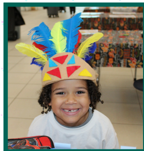
THANKSGIVING FEAST Kindergarten and Pre-K students enjoyed a feast with their friends and teachers.