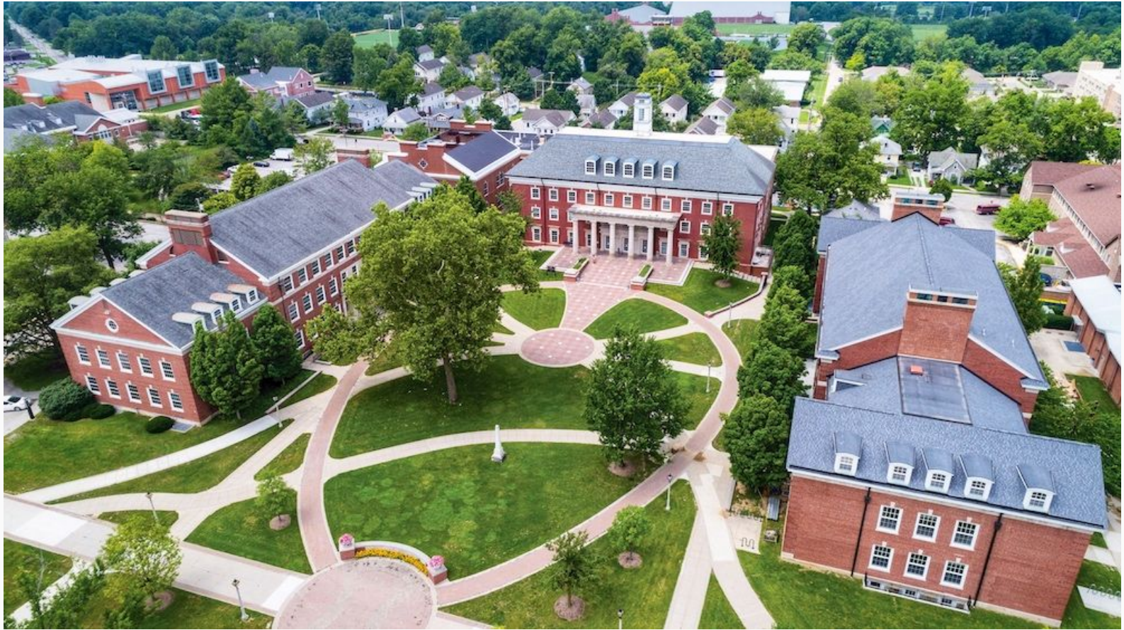
Small, liberal arts college town with a city 40 miles away