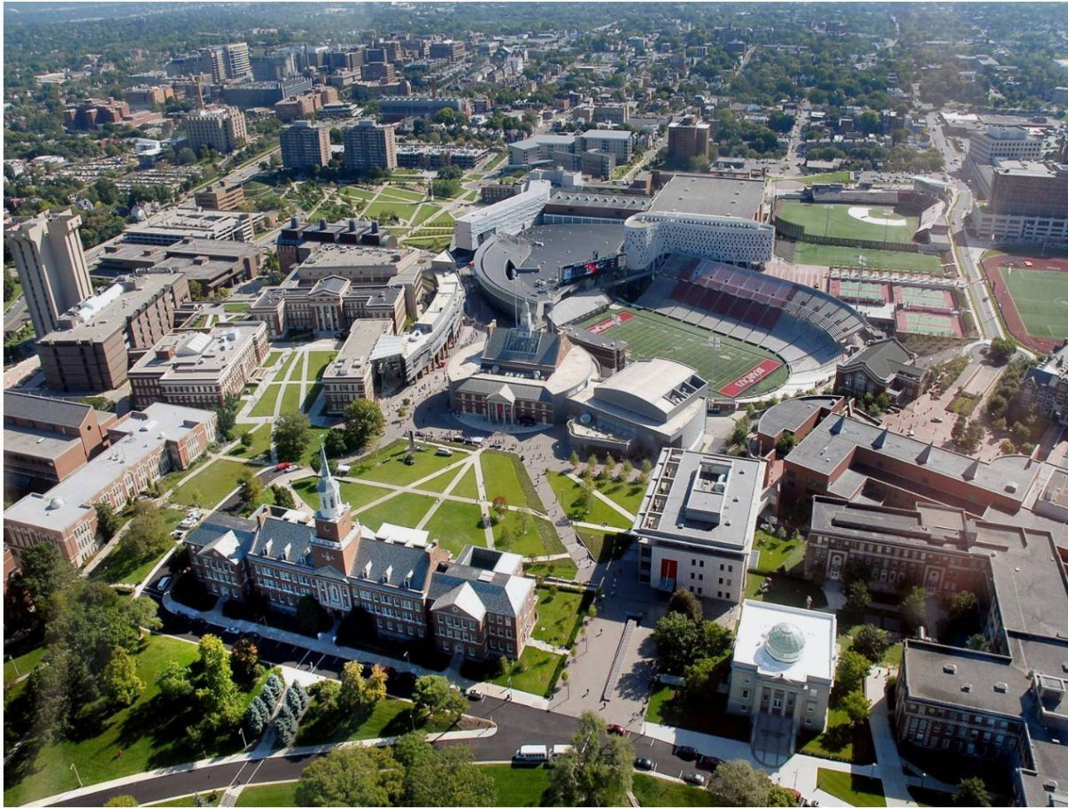
Large research university in a large city.