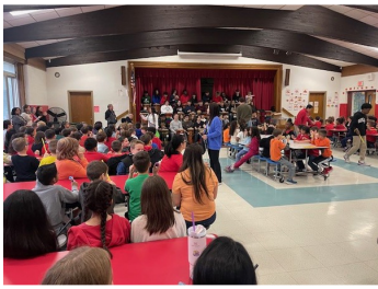
Drum Club Assembly