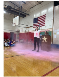
Kick off to the Color Run