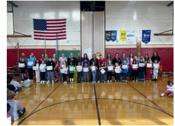
Student of the Month - Responsibility