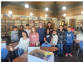
Helping with the Food Drive- Grade 5