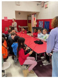
Drum Club Assembly