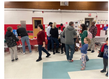
Heritage Day 3