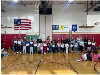
Student of the Month - Respect