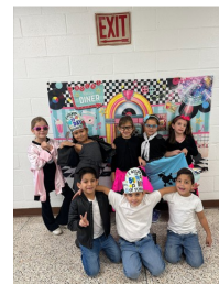
50th Day of School