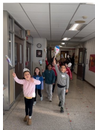
North Coleman Thanksgiving Parade