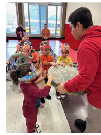
Drum Club Assembly