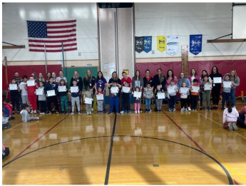
Student of the Month - Most Improved October