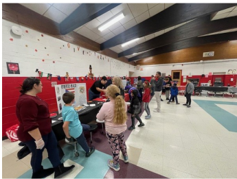
Heritage Day 1