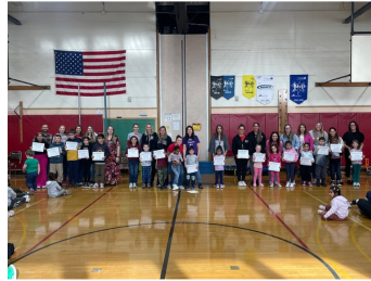
Student of the Month- Most Improved