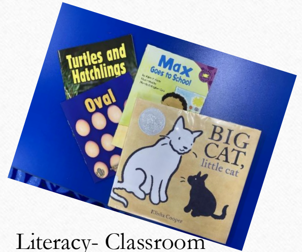
Literacy- Classroom books to read