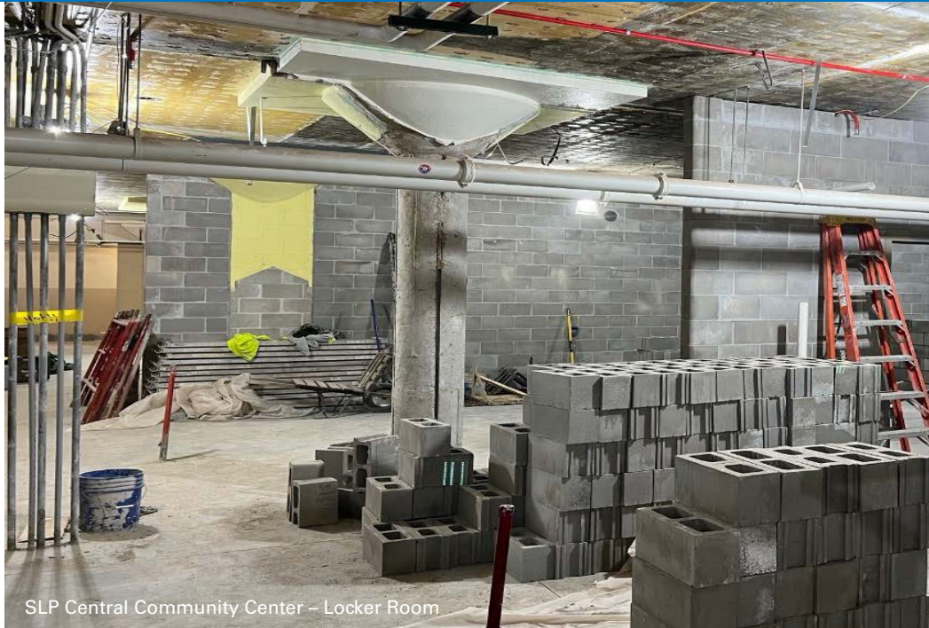
SLP Central Community Center – Locker Room