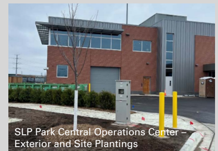
SLP Park Central Operations Center – Exterior and Site Plantings