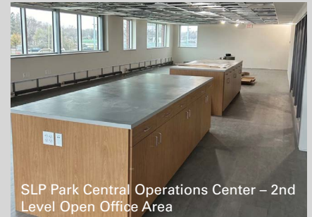
SLP Park Central Operations Center – 2nd Level Open Office Area