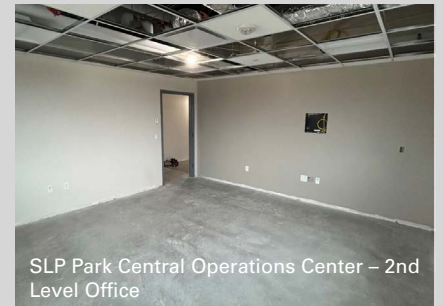
SLP Park Central Operations Center – 2nd Level Office