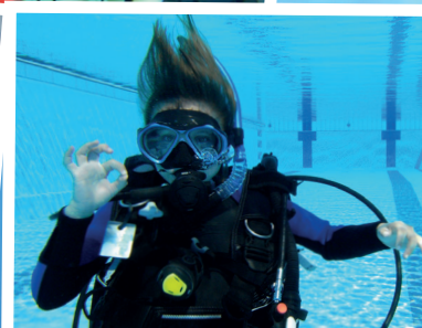
Discover Scuba Diving