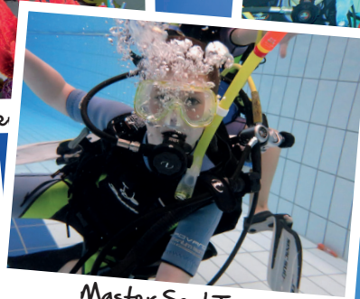
Master Seal Team