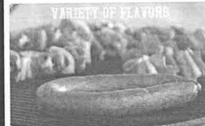
F COUNTRY PLEASIN' VARIETY SAUSAGE PACK