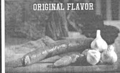
E COUNTRY PLEASIN' ORIGINAL SAUSAGE PACK

Perfectly Hickory Smoked; injected and marinated to ensure juiciness 5-6lb precooked weight