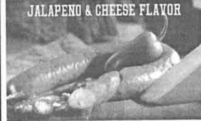
D COUNTRY PLEASIN' JALAPENO & CHEESE PACK

Perfectly seasoned Hickory Smoked 7-8lb precooked weight