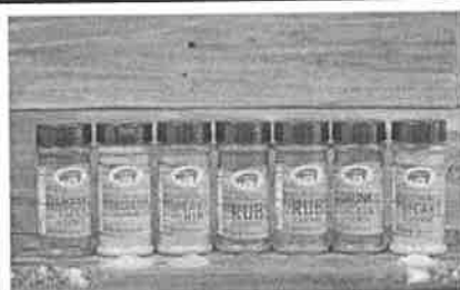
C COUNTRY PLEASIN' SIGNATURE RUBS

Box includes (5) 14oz packs of ORIGINAL FLAVOR sausage