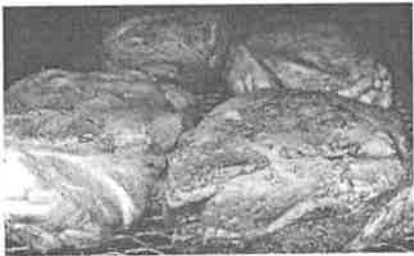
A COUNTRY PLEASIN' SMOKED BOSTON BUTT