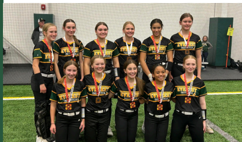
(ABOVE) Softball Tournament