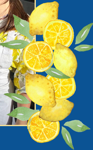
Pantheon & Pici Pasta