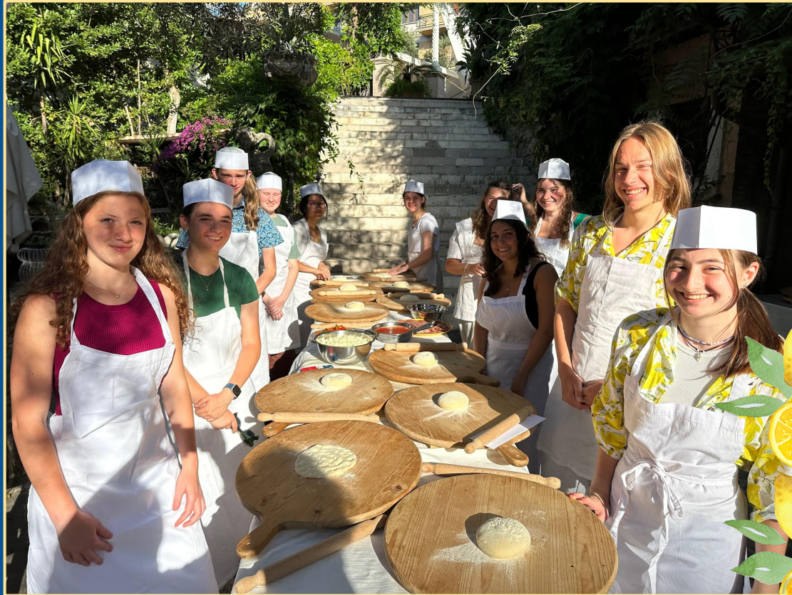
Pizza making class