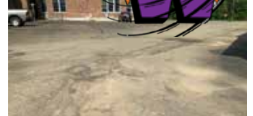
PARKING LOT REPLACEMENTS