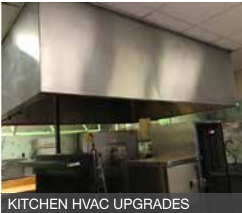
KITCHEN HVAC UPGRADES