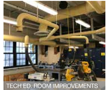
TECH ED. ROOM IMPROVEMENTS