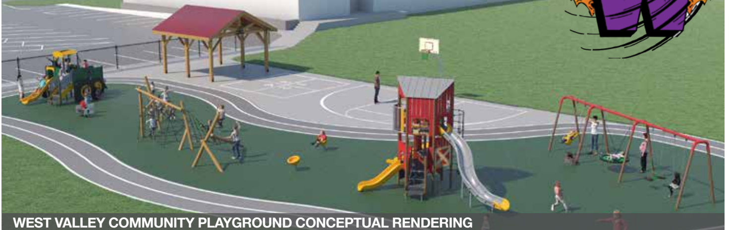
WEST VALLEY COMMUNITY PLAYGROUND CONCEPTUAL RENDERING