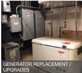
GENERATOR REPLACEMENT / UPGRADES