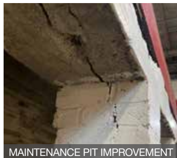
MAINTENANCE PIT IMPROVEMENT