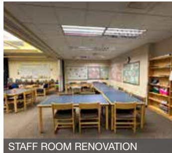
STAFF ROOM RENOVATION