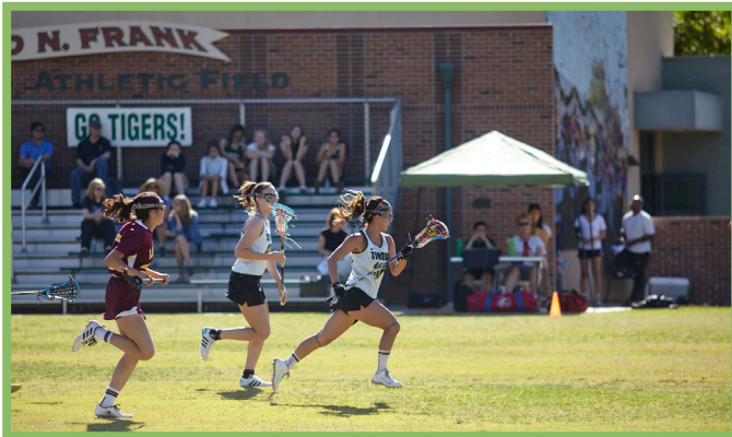
RICHARD N. FRANK ATHLETIC FIELD