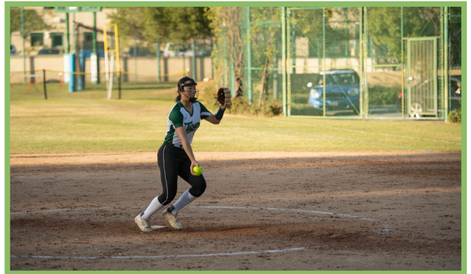
RICHARD N. FRANK ATHLETIC FIELD