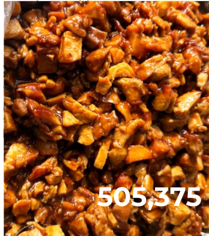
Lunch Meals Served