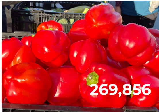
Breakfast Meals Served