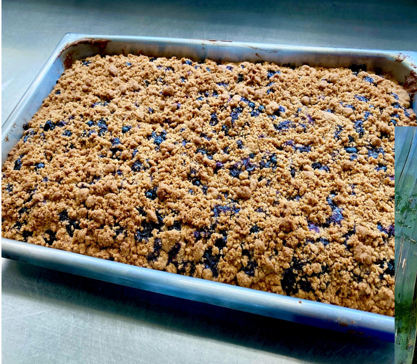
Left: Blueberry Bread