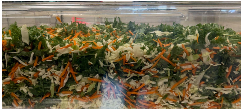
Homestyle Ranch Salad