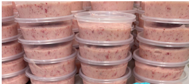
Strawberry Banana Smoothie