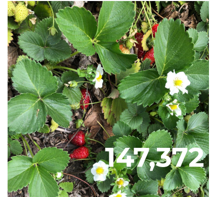
Supper Meals Served