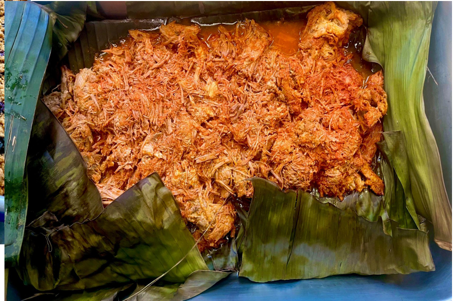
Below: Cochinita Pibil