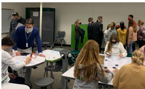
Board members and administrators observe middle school students using new 3D printers and pens.