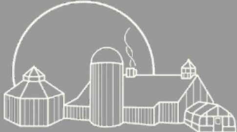
The Mountain School