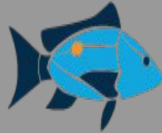
The Island School