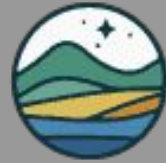
THE TRAVELING SCHOOL