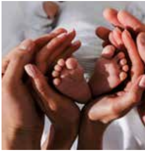
Art & Crafts Science & Math Sensory Play Stories