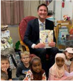
Circle & Gym Time - Outdoor Classroom