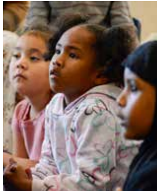
Building Routines Social Skills Listening Learning