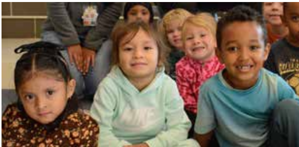
Independence - Cooperation - Relationships - Play