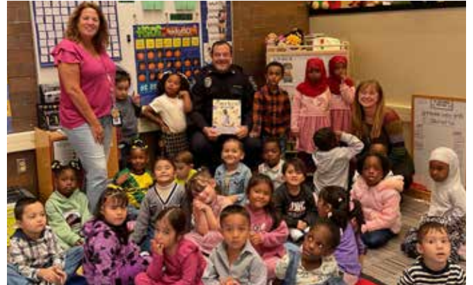
Early Childhood programs include ECFE classes, Screening, Preschool, Ready To Grow/Learn - Early Care & Education

Newborn to Age 8 EX-33/4 10:45 am-12:15 pm