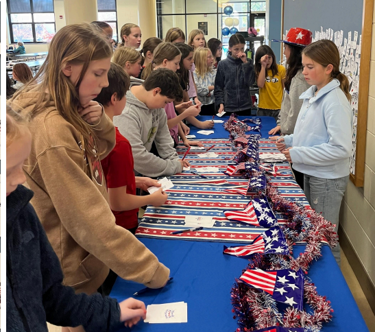
(Above) Students write the names of Veterans to honor on our bulletin board in the cafeteria. (Below) Our completed Veterans Day board.