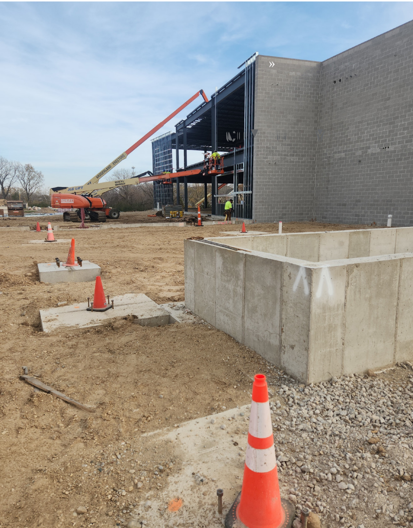
CLASSROOM WING METAL STUD FRAMING