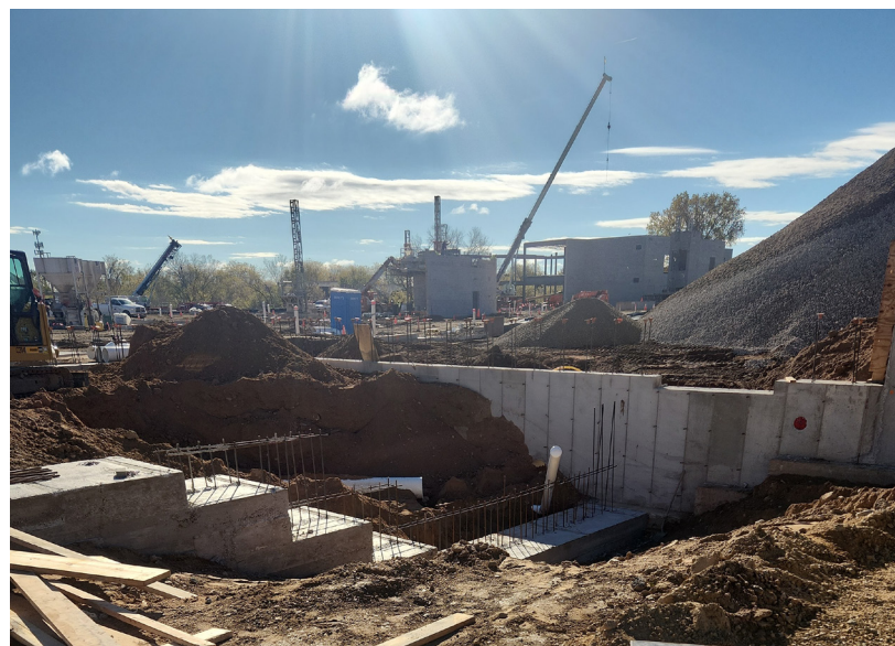
STEPS IN GYMNASIUM FOUNDATION