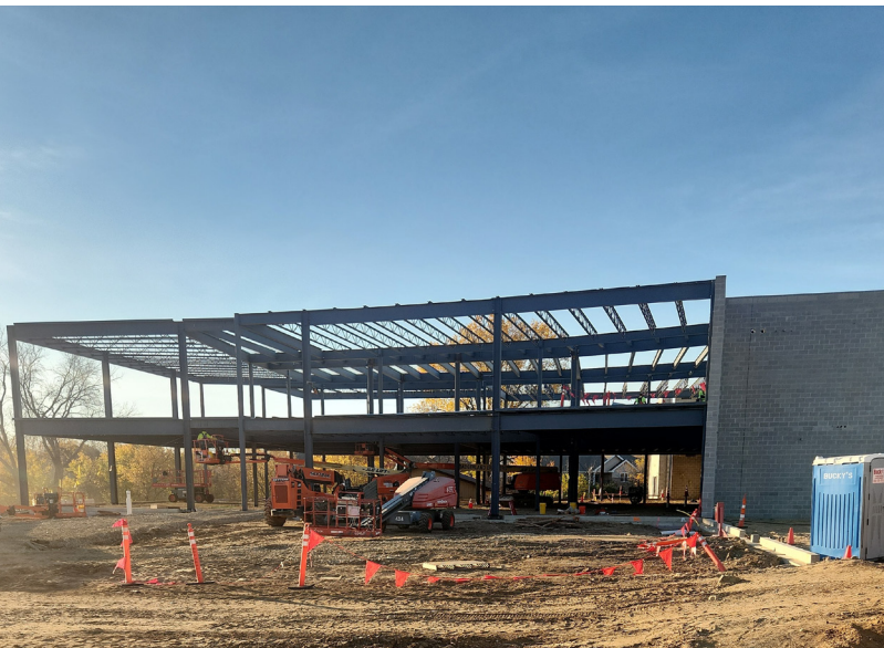
CLASSROOM WING STEEL