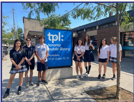
Great Citywide Scavenger Hunt