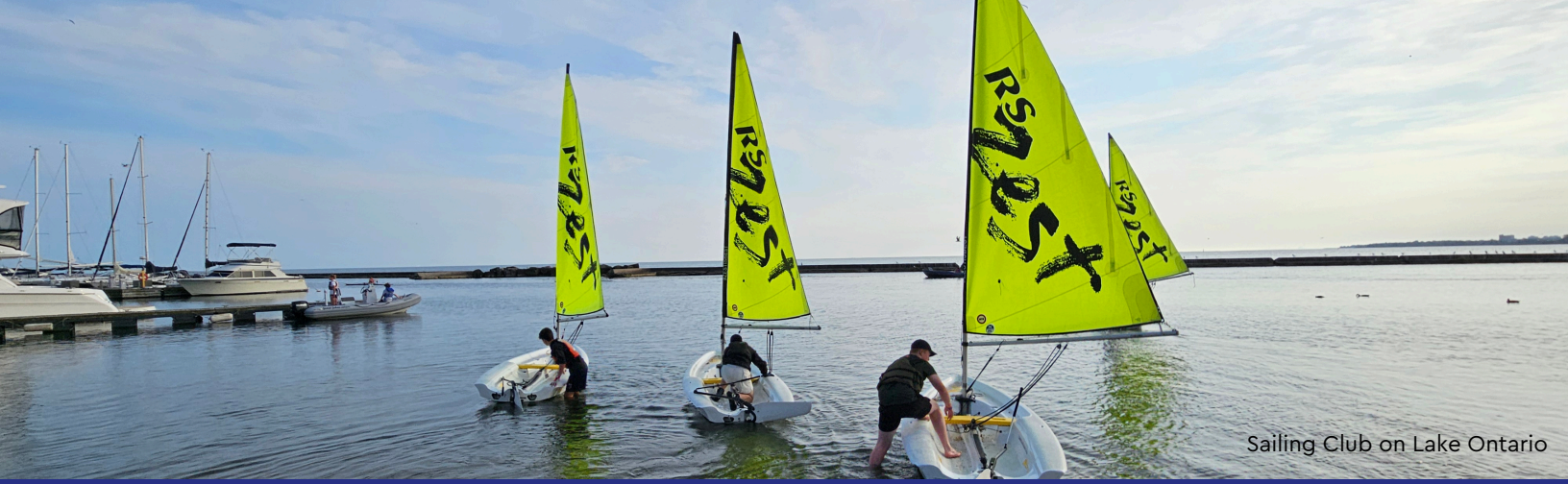
Sailing Club on Lake Ontario