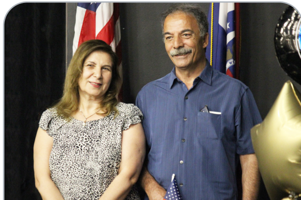
Learn more about the benefits of our free English as a Second Language classes at www.prcommunityed.org

Spring 2025 classes begin Monday, January 6. Classes are ongoing and new students are added to classes weekly. Students must attend a testing and/or orientation session before beginning classes. Once our office reviews your application, a staff member will contact you regarding testing and/or orientation. For information about locations, class times and registration, visit prcommunityed.org or call/text 314-415-4940.