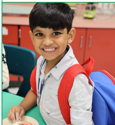
E-Hour programs are offered at every elementary school in Parkway and Rockwood.

Visit prcommunityed.org for a list of classes at your child's school and to register.