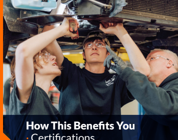
Certifications Paid Internships College Credit

Prepared for ASE Certification, immediate employment and further education