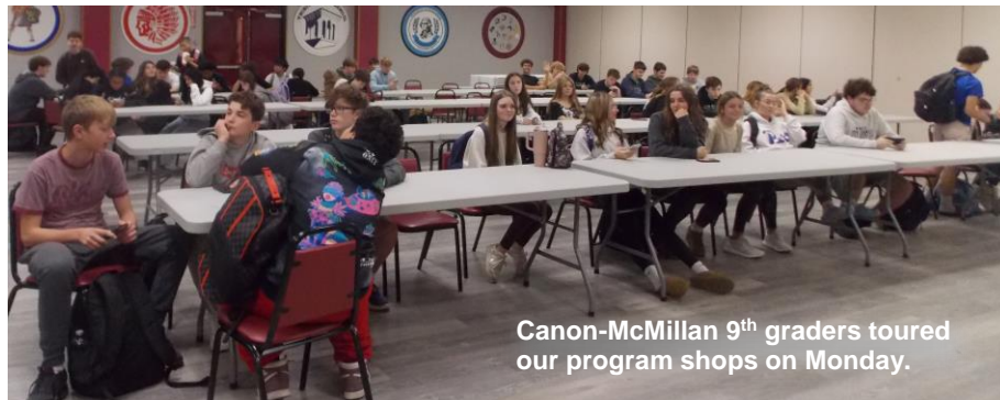
Canon-McMillan 9th graders toured our program shops on Monday.