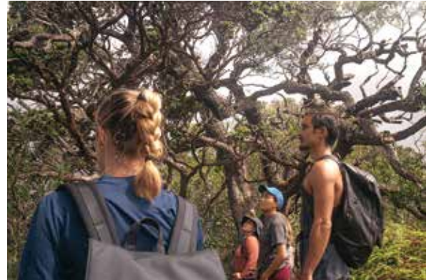
Above: Along the hike to the project site, the group pauses to examine and learn about some plants they are seeing along the way.