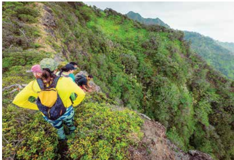
Under the leadership of Protect & Preserve, volunteers hike into Pia Valley to learn about the ecosystem and take part in restoration efforts.

As with every project day at Protect & Preserve, this volunteer gathering in September began with a personal introduction of everyone present, an oli (a Hawaiian chant) to ask for wisdom