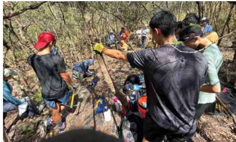
Volunteers watch and learn how to dig out invasive plants and to plant native grass in its place.

When it came time to put their hands to work, everyone grabbed buckets, sickles, and shovels, and donned protective gloves. Cheng explained how the group dug and pulled out invasive plants, especially guinea grass root balls, and then planted a type of native grass that would help with soil stability and help to restore