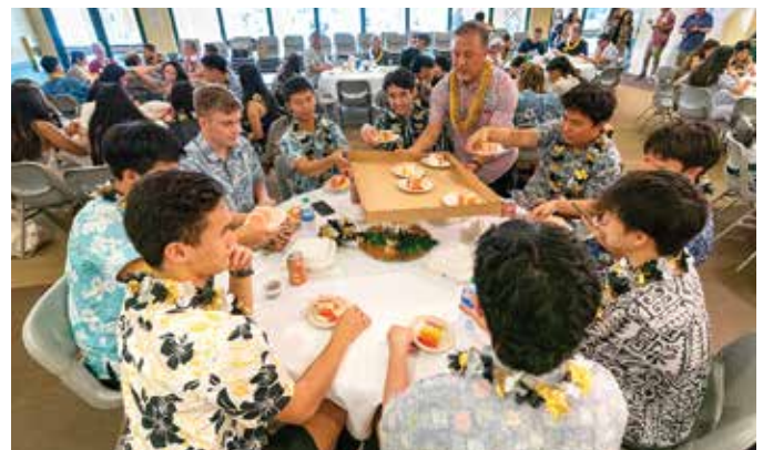
Seniors enjoy a piece of delicious guava cake to finish off their Hawaiian meal.

We're so grateful for all of the students, faculty, and staff that made this day a success and blessed the class of 2024!