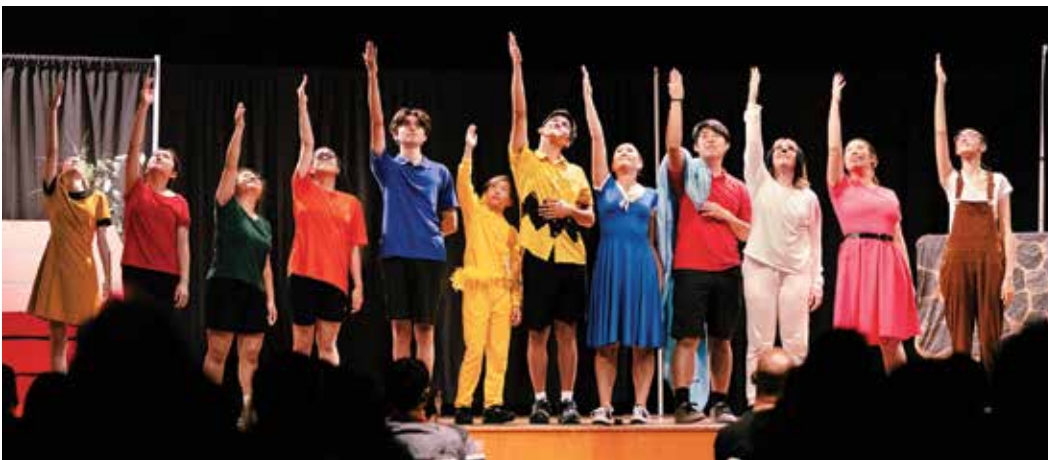
HBA students perform in "You're A Good Man, Charlie Brown" musical.