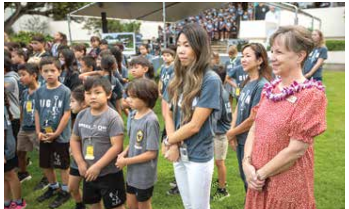
Elementary students, faculty, and staff were part of the ceremony.

The new facilities will include state-of-the-art spaces equipped with the latest technology, fostering dynamic learning environments. Highlights include the 7,000 square-foot Innovation and Discovery Center, rooftop deck, outdoor amphitheater, multi-use