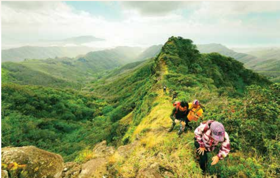
The view, looking south over the Hawai'i Kai area, from the upper portion of Pia Valley.