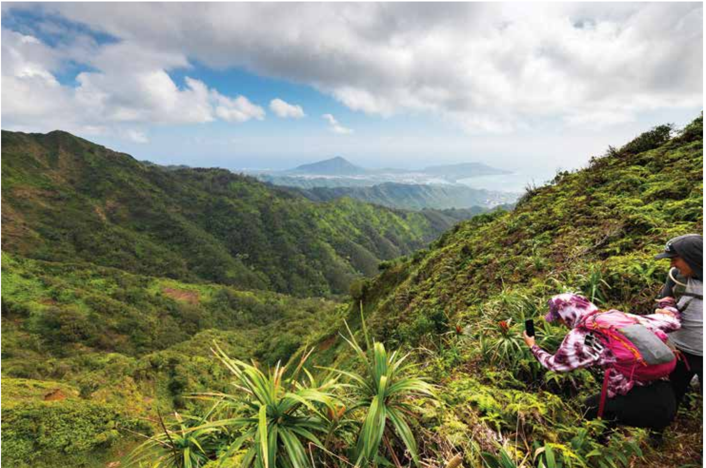
A volunteer pauses during a hike up the Pia Valley ridge to take a photo of a plant. In the distance on the left is Koko Crater.