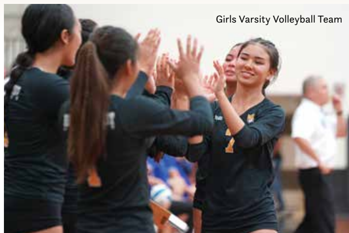
Girls Varsity Volleyball Team