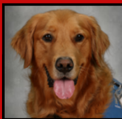
Facility Dog Fred