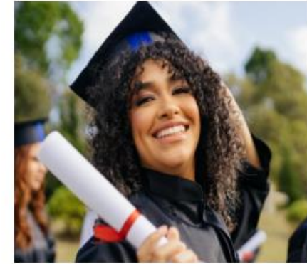
Move to One NYS High School Diploma