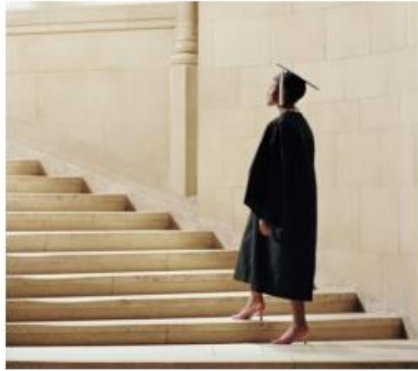
Adopt a NYS Portrait of a Graduate