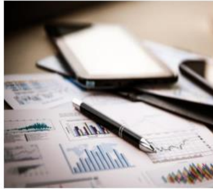
Redefine Credits and Learning Experiences