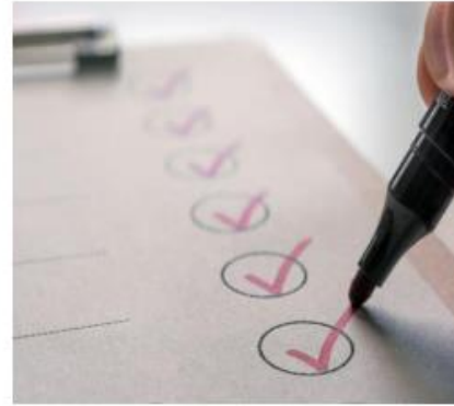
Sunset Diploma Assessment Requirements