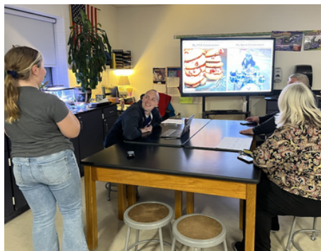
River Bluff Middle School

Students expressed their gratitude by creating a Student Gratitude Tree! More than 200 students shared what they are most thankful for, including uplifting and inspiring messages that filled the school with positivity. We also honored our Veterans with a special Veterans Day celebration, welcoming them to greet students as they entered the school.