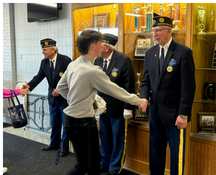
Stoughton High School

Students expressed their gratitude by creating a Student Gratitude Tree! More than 200 students shared what they are most thankful for, including uplifting and inspiring messages that filled the school with positivity. We also honored our Veterans with a special Veterans Day celebration, welcoming them to greet students as they entered the school.