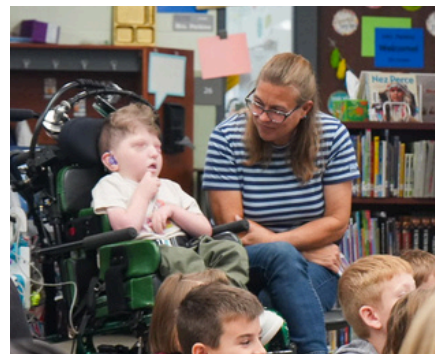
Fox Prairie Elementary

Students will also celebrate a dance this Friday!