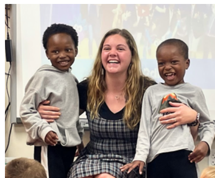
4 Year Old Kindergarten

The WFK Fall Festival and Read-a-Thon were a huge success, thanks to the support of the amazing community! We also want to highlight the relaunch of Sandhill's Safety Patrol program, where fourth and fifth-grade students are stepping up to lead and support our younger students.