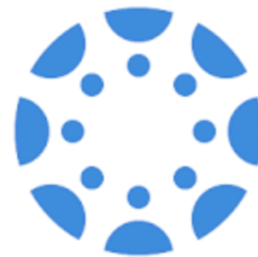
CANVAS PARENT APP