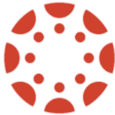
CANVAS STUDENT APP