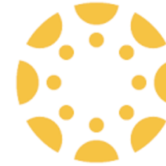
CANVAS TEACHER APP