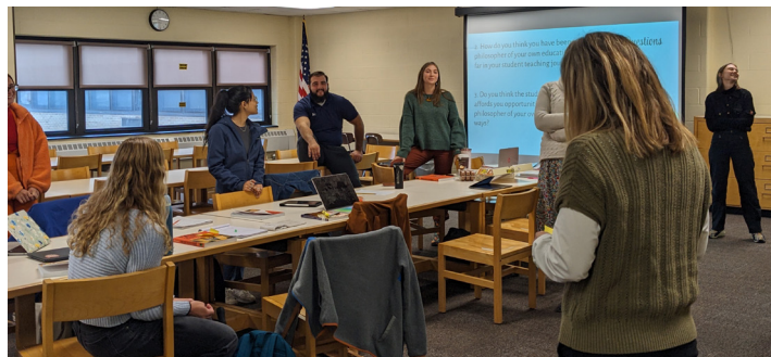
CLINTON CENTRAL SCHOOL DISTRICT

The Clinton Central School District recently welcomed a group of Colgate University students as part of their seminar for education majors. This visit was part of a "road show" designed to give these aspiring educators a firsthand look at a variety of school districts. Clinton Central School District is proud to frequently host pre-service teachers for observations and internships from area colleges, including Colgate University, Utica University, Hamilton College and Mohawk Valley Community College (MVCC). By providing these opportunities, we remain dedicated to supporting the growth of future educators and promoting the teaching profession.