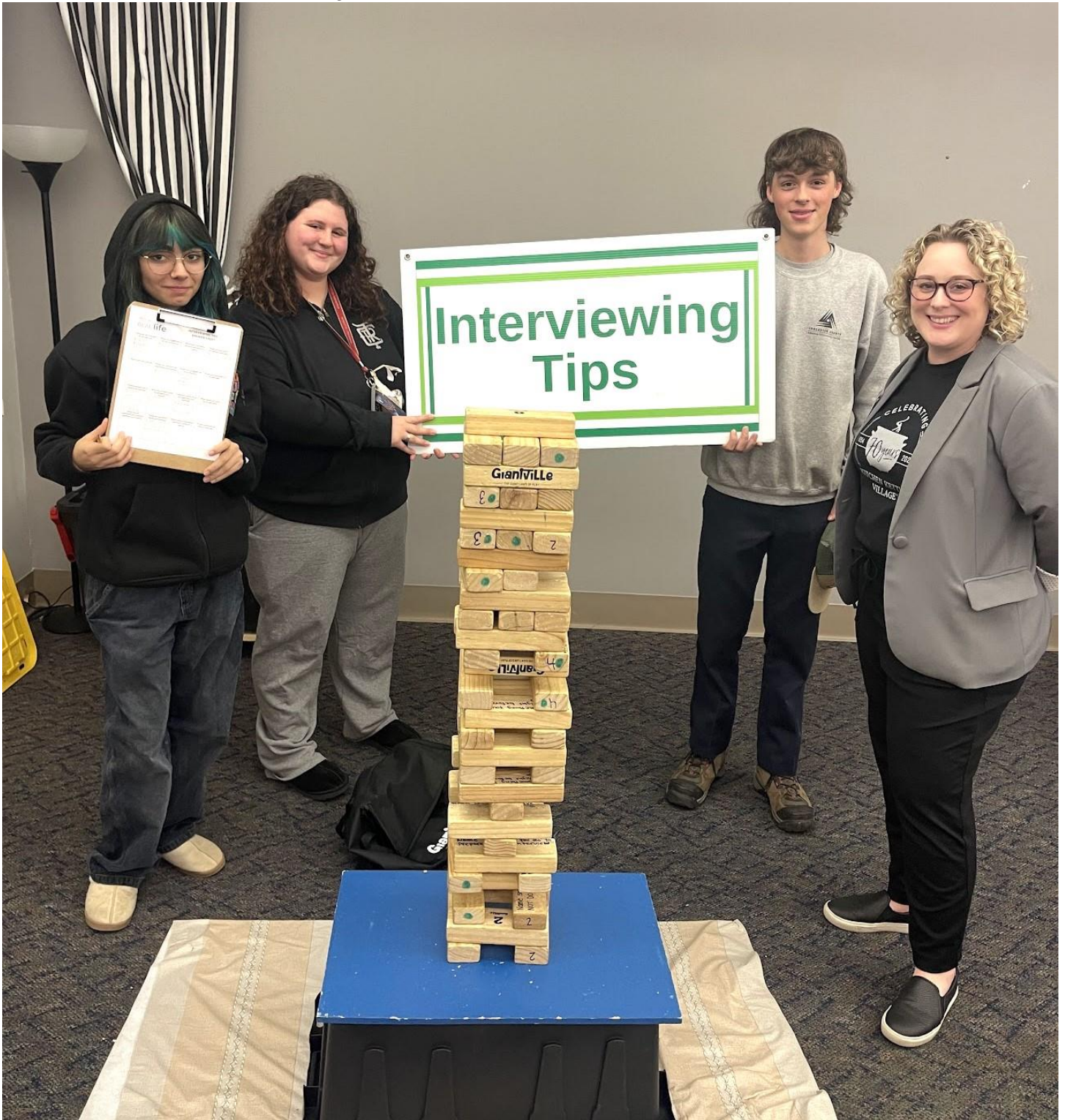
Interview Tips Question Jenga