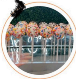
Protein Cake Pops