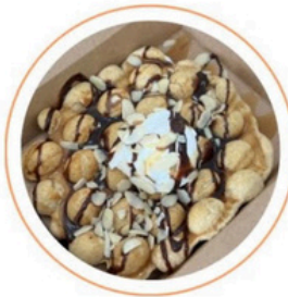
Protein Bubble Waffles

Follow us on IG & FB to view our Full Menu @Thedailyspot_FI