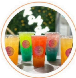
Sugar Free- Energy Drinks