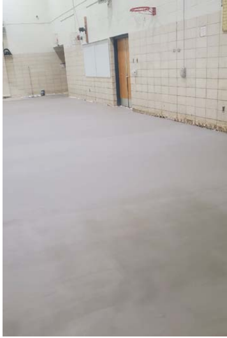
Above: Area of old floor base being removed (L); new concrete poured to level floor (R)