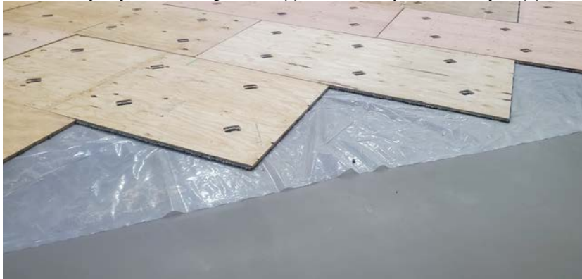
Left: Moisture barrier under subflooring