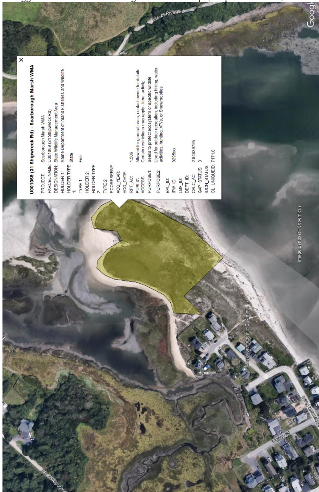
Figure 1. Higgins Beach Wildlife Management Area Map: [Adopted 11-06-2024]