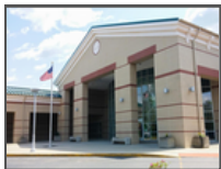
Bryan Station High School