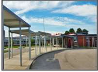
Cardinal Valley Elementary*