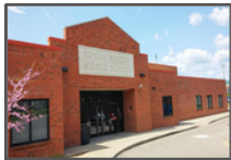
Bryan Station Middle School