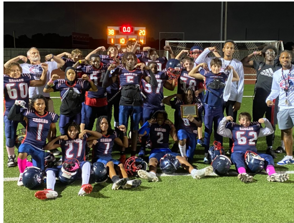
Clear Lake Intermediate—7A

Congratulations to Clear Lake 7A and Bayside 7B teams for being District Champions