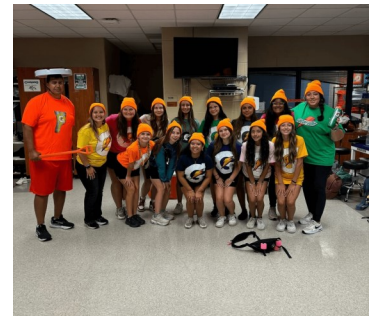
Clear Springs Athletic Trainers Halloween Fun!