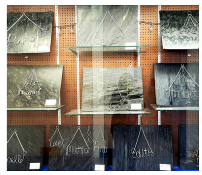
Art Studio II: Wire Name Sculptures JTLSD Jr./Sr. High School

Greetings to all of Jefferson Township Families! I am excited to be working with the students in Visual Arts. In art, the focus will be bringing a variety of art genres and art movements throughout history to ignite creative thinking in order to create skilled and unique artworks in each grade level. In grades K-12, we will be learning to utilizing various art skills and techniques throughout the school year, based on state standards. Students are encouraged to bring a positive attitude, respect for oneself and others, try for excellence, bring creativity, and to safely meet the target goals. The first art project of the year completed by students was art dedicated to the uniqueness of each student, with name art for grades 4-12, and self-portraits with grades K-3. Each is currently being displayed in the hallways at Jefferson Jr./Sr. High School and Blairwood Elementary. I am excited to showcase your students' hard work and dedication in their art this year!