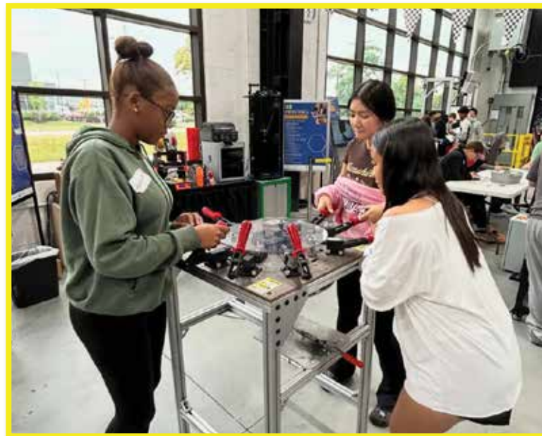
Brooklyn Ninth Graders engaged in hands-on learning with manufacturing technology during the recent MAGNET site visit.

Ninth grade students got a first-hand look at in-demand jobs and careers in manufacturing on a recent visit to the Cleveland location for MAGNET, The Manufacturing Advocacy and Growth Network. The freshmen class was divided into three small groups of twenty-five students, with each group visiting MAGNET on one of three specific dates, Tuesday, 9/24, Thursday, 9/26, or Friday, 9/27. During the visit, students learned helpful information about Northeast Ohio's manufacturing industry, including available jobs and salaries. Students also participated in an immersive learning experience which featured a facility tour, and hands-on exploration of various machinery and tools. Brooklyn students also used their collaboration skills in a friendly competition to construct motorized cars. The group which successfully built the fastest, heaviest, and cheapest car won a free soda served by a robot! Throughout the entire program, students were engaged and were excited for the opportunity to explore new career skills and opportunities.