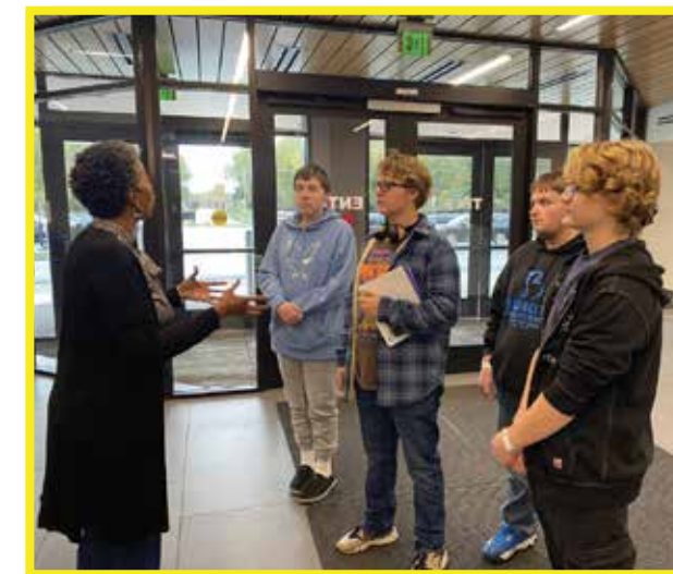
Several BHS students were able to meet with area IT professionals at the recent symposium hosted by Medical Mutual.

Several Brooklyn High School students seized the opportunity to gain more experience about career paths and innovative technology within the health insurance industry at the inaugural Medical Mutual IT and Data Analytics Symposium held at the company's Brooklyn headquarters on Tuesday, October 15, 2024. The visit included an engaging presentation on the increasingly pivotal role of data, analytics, and IT in the health insurance industry. Students also listened to and interacted with members of a speaker panel which provided valuable insights on the key attributes Medical Mutual seeks in student applicants for internships and full-time positions. Additional break-out discussions and exhibit topics included application and development, IT security, infrastructure, data analytics and data engineering. The site visit to Medical Mutual is part of the High School Career Exploration and Planning Program and aligns with the Career and College Readiness pillar featured in the District's Strategic Plan. On behalf of the Brooklyn City Schools, thank you to Medical Mutual for providing our students an in-depth career exploration experience.