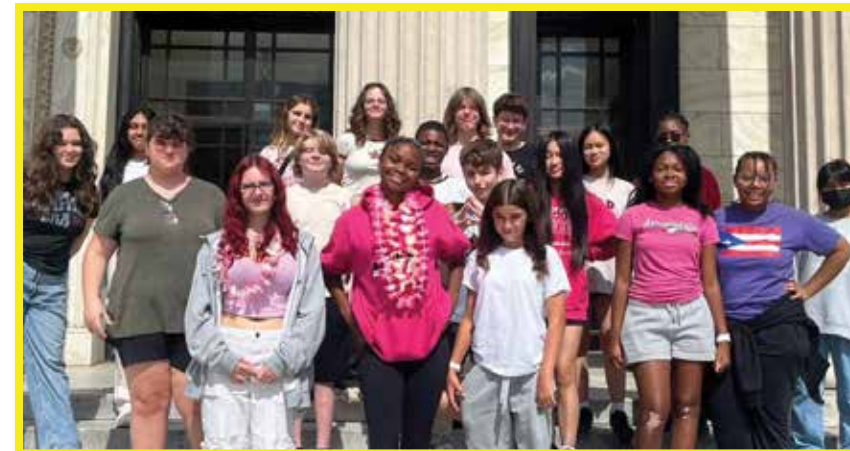
Visits to the Cleveland Museum of Art are one of many learning enrichment opportunities provided to students.