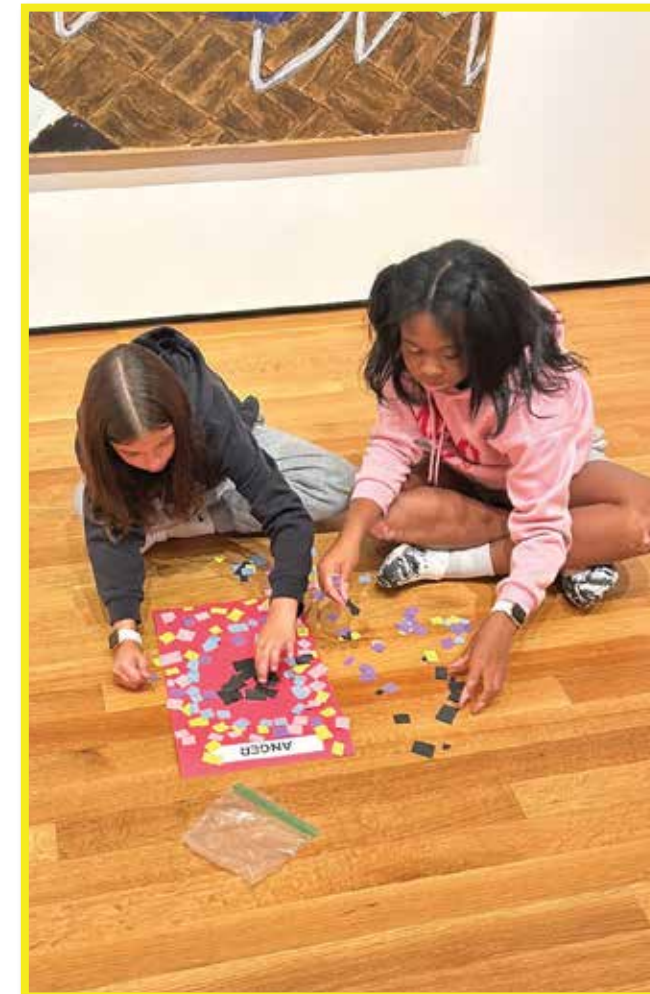
Brooklyn students enjoyed interactive activities related to the artwork on display.