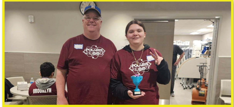
Celebration of the 2023-24 School Year

A group of three people posing in a basketball gym. On the left, a man with a beard and a black jacket is making a hand gesture. In the center, a woman wearing a white 'BROOKLYN' basketball jersey and white leggings is holding an orange basketball. On the right, another woman in a black turtleneck and grey pants is also making a hand gesture. The background shows a basketball hoop and a wall with 'BROOKLYN HURRICANES' written in large yellow letters.