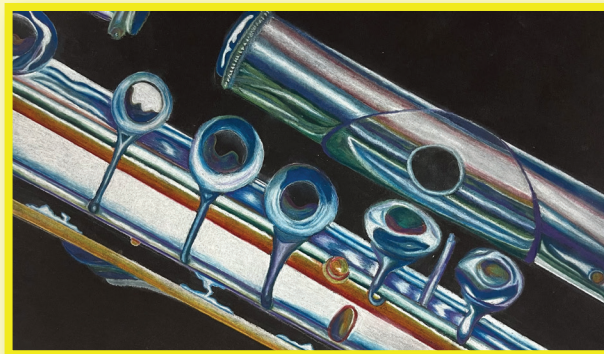
Calissa Schillinger Harmony Art: Drawing & Illustration Gold Key