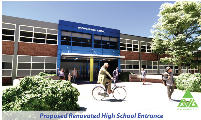
Proposed Renovated High School Entrance