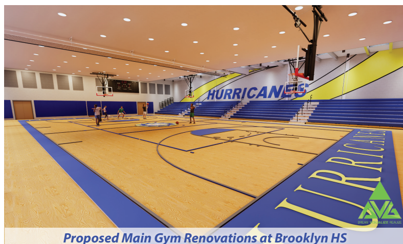
Proposed Main Gym Renovations at Brooklyn HS