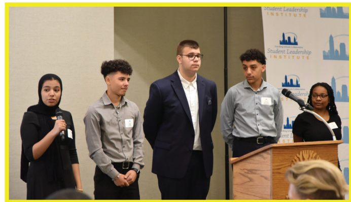
Brooklyn students presented their research at the First Ring Student Leadership Institute.