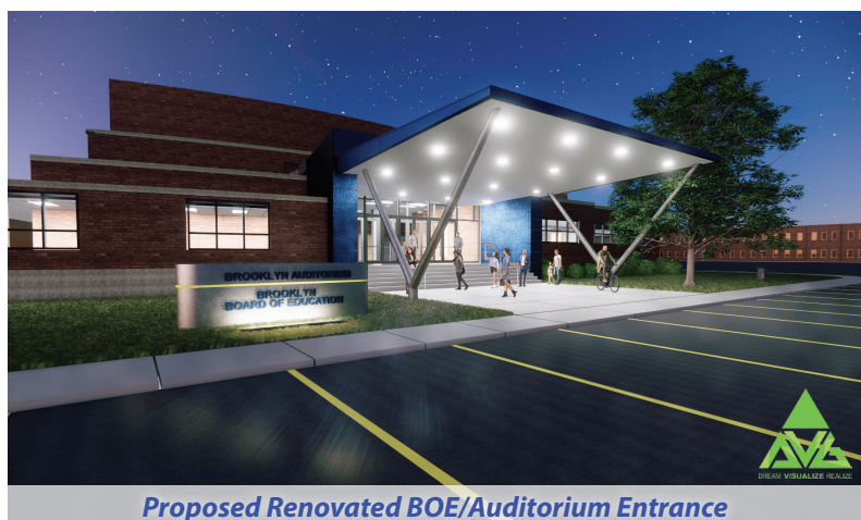
Proposed Renovated BOE/Auditorium Entrance