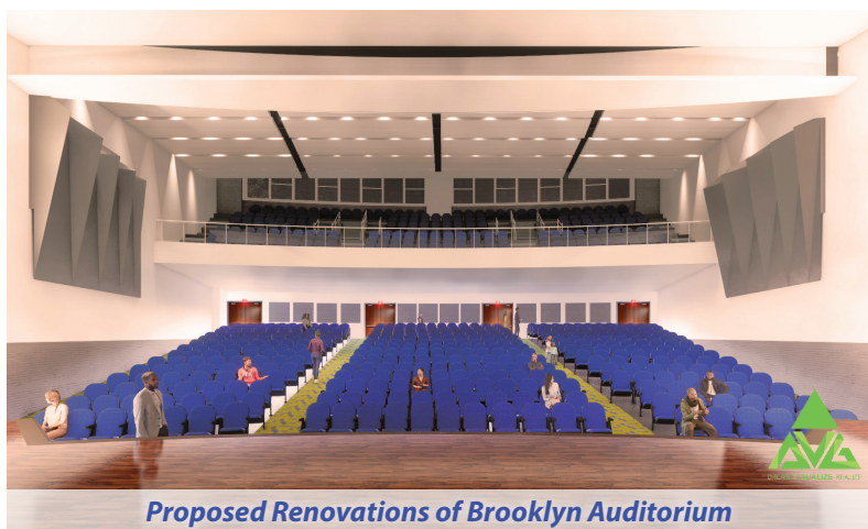
Proposed Renovations of Brooklyn Auditorium