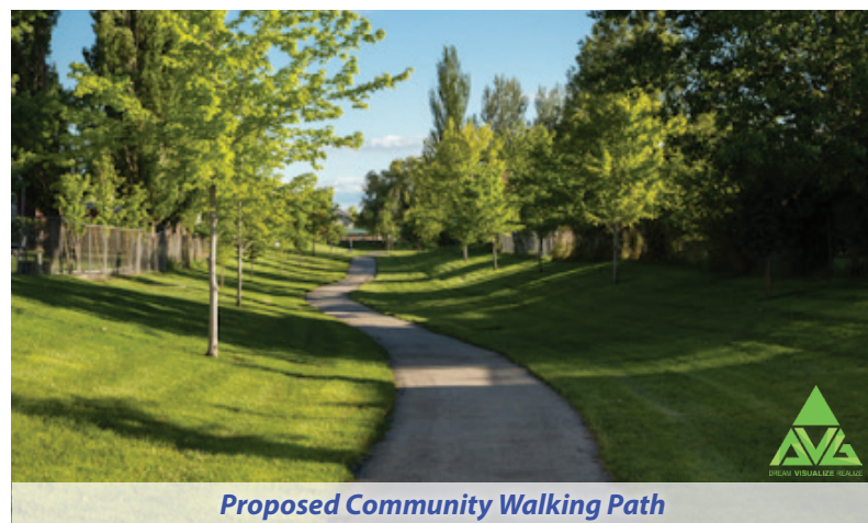
Proposed Community Walking Path