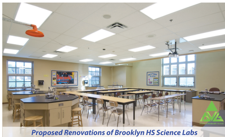
Proposed Renovations of Brooklyn HS Science Labs