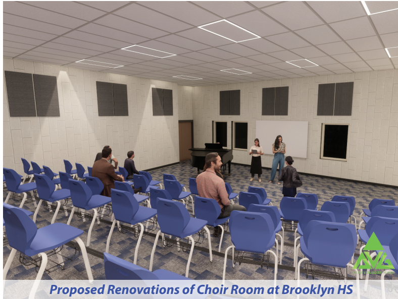
Proposed Renovations of Choir Room at Brooklyn HS