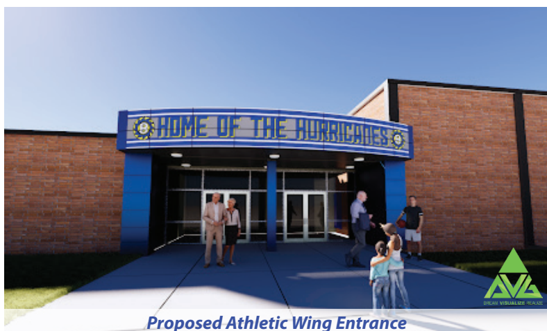
Proposed Athletic Wing Entrance