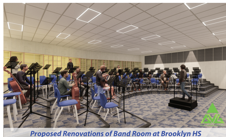
Proposed Renovations of Band Room at Brooklyn HS