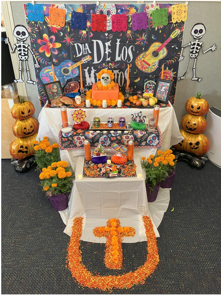
Community Room Ofrenda