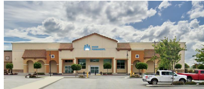
Artist's rendering of new Salinas Medical Offices

Kaiser Permanente's newest medical offices will feature Adult & Family Medicine, Pediatrics, Ob-Gyn, Dermatology and other specialty services to be determined. The Salinas Medical Offices will also provide Radiology, Pharmacy and Laboratory services.