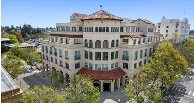
At the new Santa Cruz Medical Offices, members have access to family medicine, lab, mammography, ob-gyn, pediatric, pharmacy, and X-ray services.