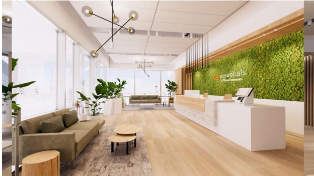
Care Essentials in the heart of downtown San Francisco.

Located at the Salesforce Transit Center in order to meet members where they are, this innovative new facility offers extended hours. Services include same-day appointments, pharmacy, lab tests, vaccines, injections, and treatment of minor illnesses and injuries.