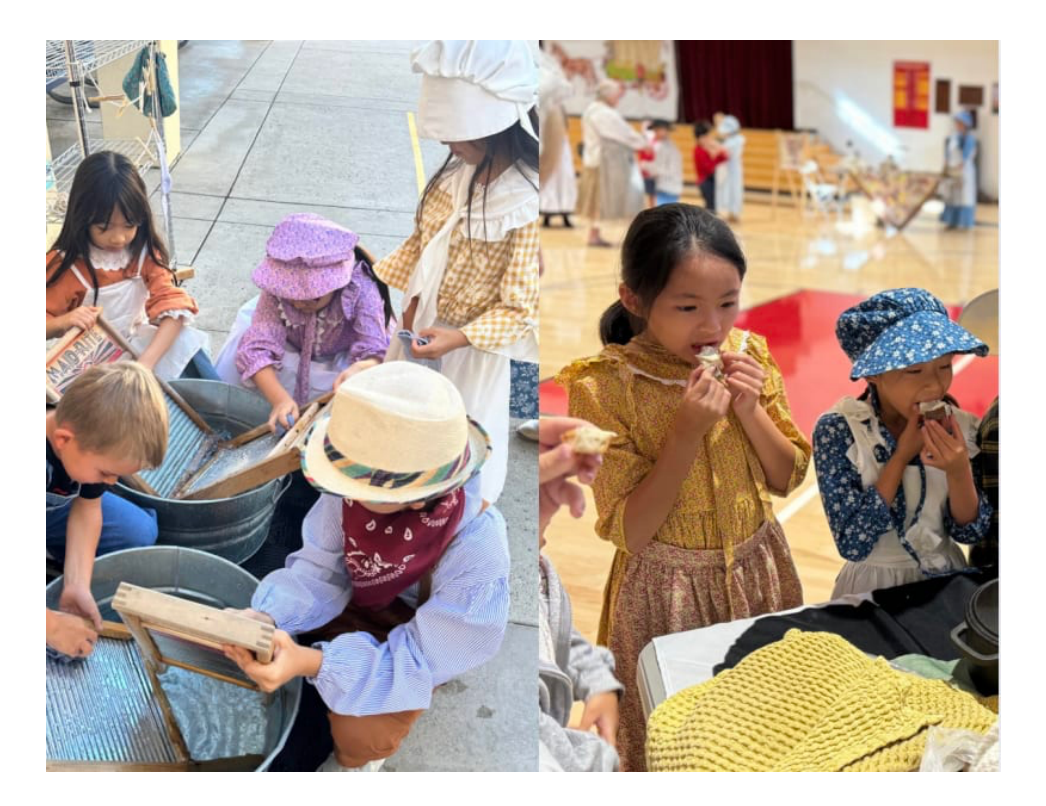
Second Grade: Pioneer Day

Our second grade students are concluding an exciting unit on the Pioneers! They have been exploring the fascinating differences between their lives today and the lives of our ancestors. Last month, students had an amazing opportunity to step back in time and experience Pioneer life through engaging centers presented by California Living History.