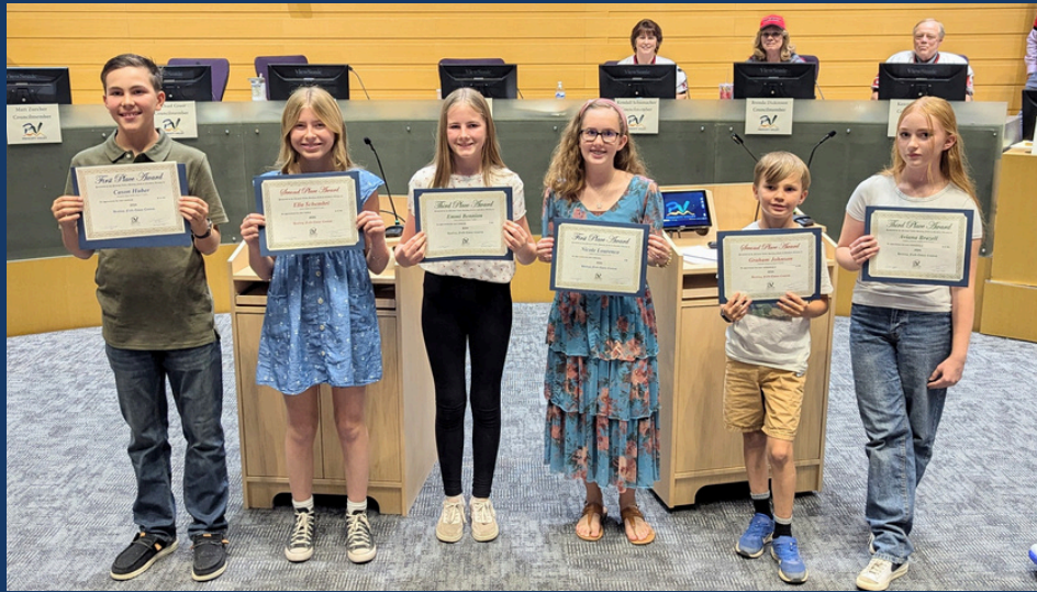
2024 Healing Field Essay Contest