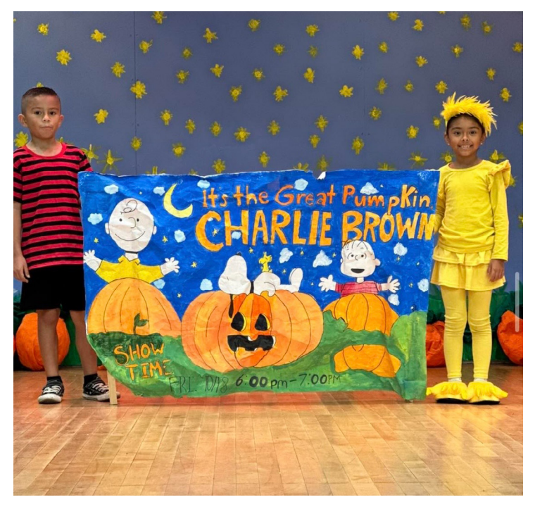
Palm Elementary School students hit the stage for their performance of "It's the Great Pumpkin, Charlie Brown" on October 18.