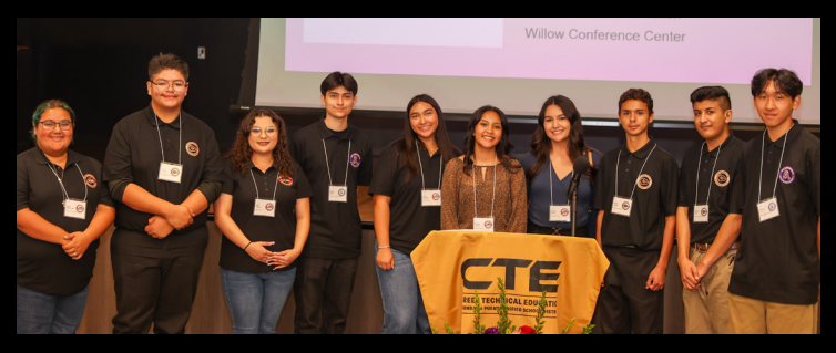
Hacienda La Puente Unified Career Technical Education (CTE) student ambassadors welcome guests to the second annual CTE Advisory Council Dinner Meeting on October 2.

Hacienda La Puente Unified hosted its second annual Career Technical Education (CTE) Advisory Council Dinner Meeting on October 2, bringing together educators, students, and industry leaders to discuss the future of career pathways and workforce readiness.