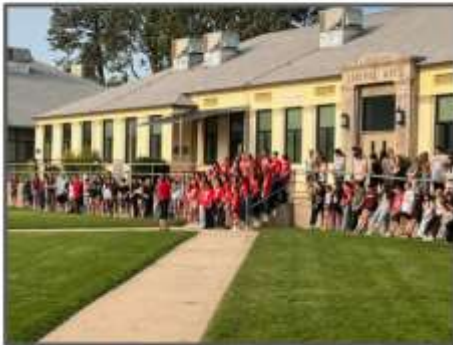
Patriot Day Recognition