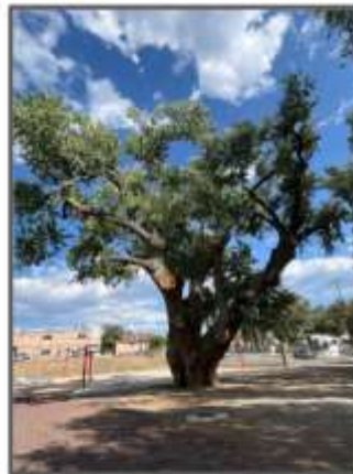
The Giant Cottonwood tree after its trim!