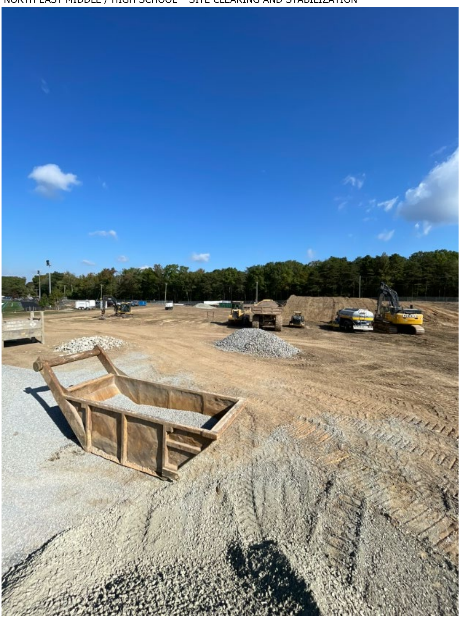
NORTH EAST MIDDLE / HIGH SCHOOL - SITE CLEARING AND STABILIZATION