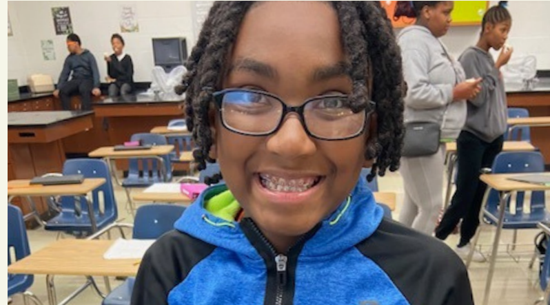
PARENTS, PARENTS, PARENTS...