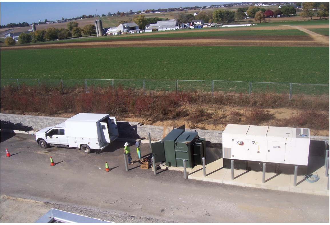
Page 7 11/5/2024