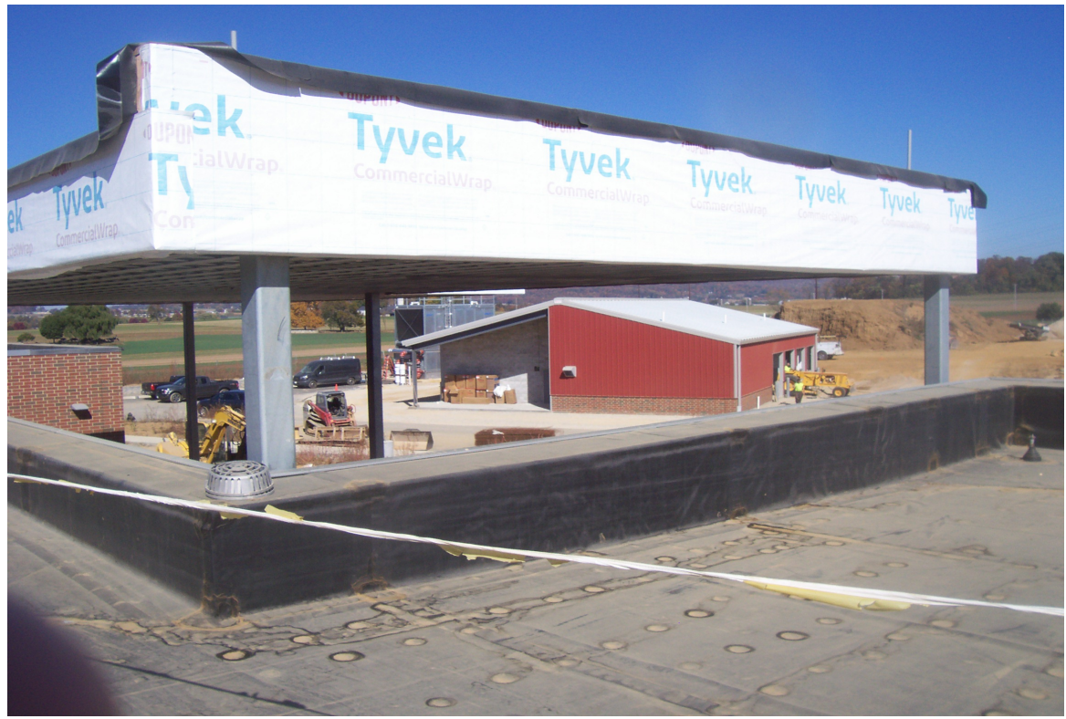
Page 6 11/5/2024