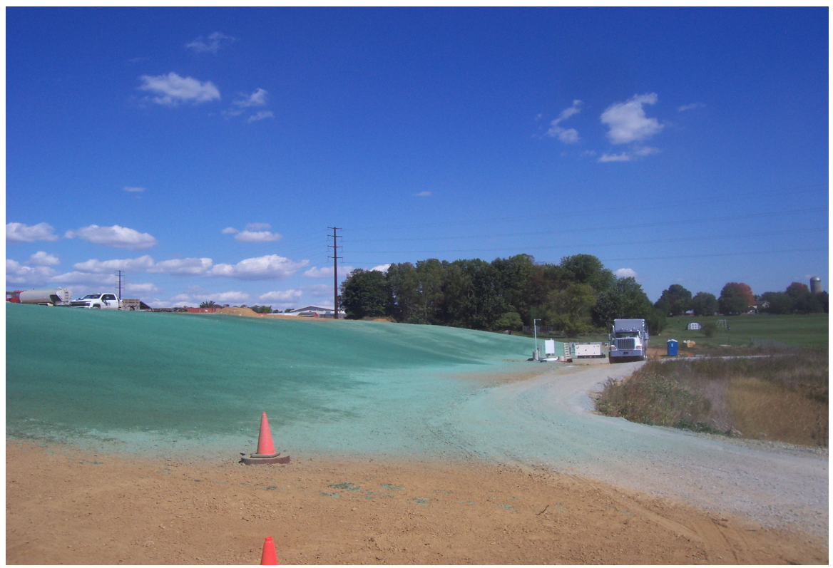
Page 8 11/5/2024