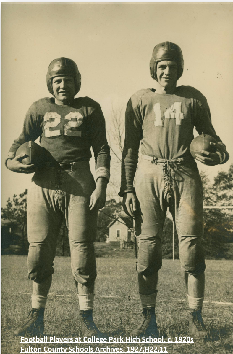
Football Players at College Park High School, c. 1920s

F all brings, along with a colorful leaves and cooler weather, football games and homecoming celebrations. Sports and school spirit have always been a favorite pastime in Fulton County Schools. This month's Curiosity Corner provides a historic example—two College Park High School students ready for the game. While the exact year is unknown, based on their uniforms, this photograph is dated to the circa 1920s.