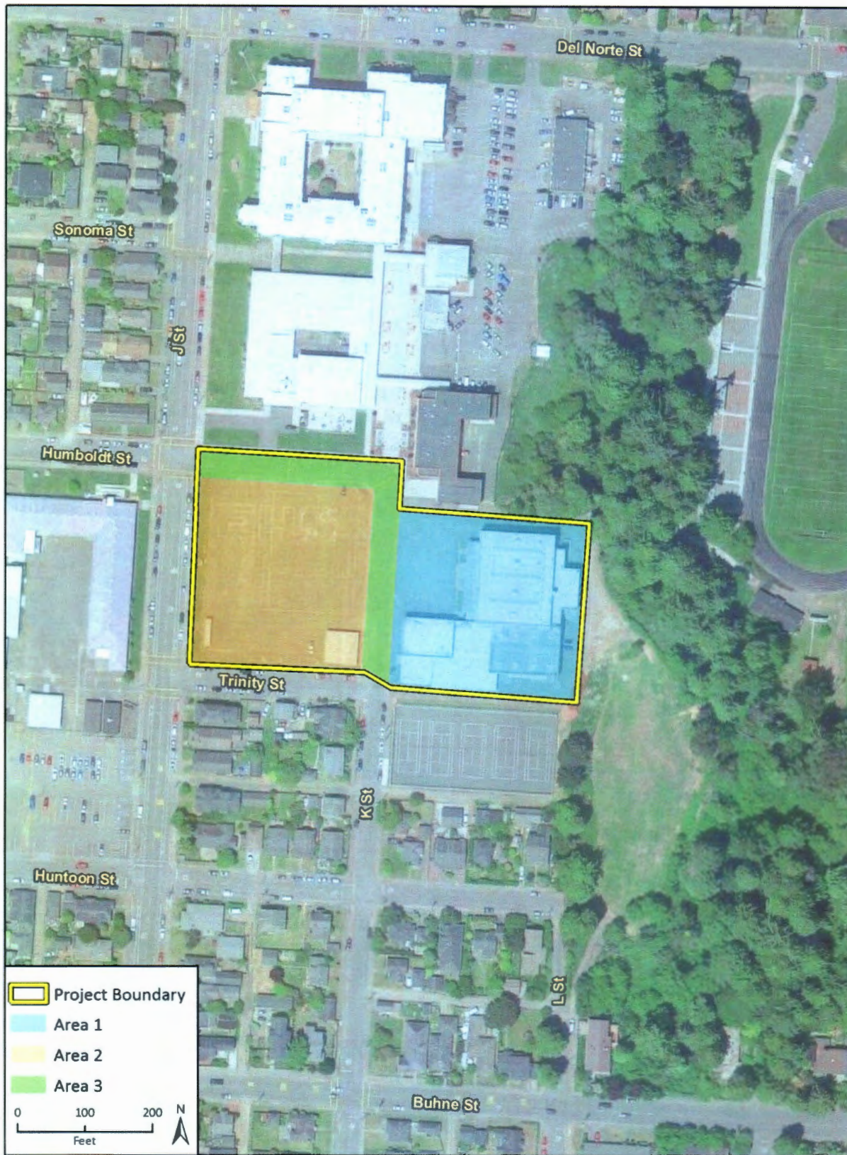
Figure 1 Project Location