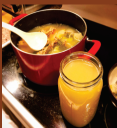
Turkey Stock pint $4.00 pint