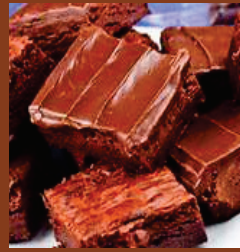
Frosted Brownies $8.00