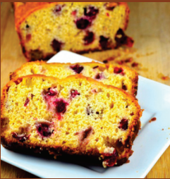
Cranberry Orange Bread $7.00