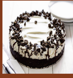
Oreo Cheesecake with Oreo Crust $13.00