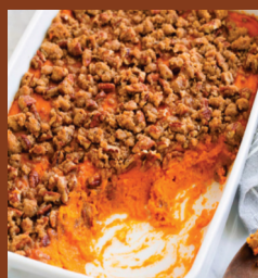
Sweet Potato Casserole $5.00

Additional menu and speciality items will be available to purchase at EVIT on pick-up days.