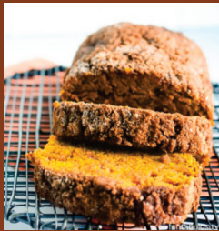
Pumpkin Toffee Bread $7.00