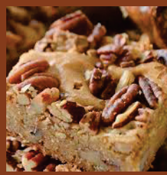
Butterscotch Pecan Blondies $8.00