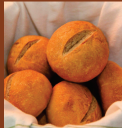
Wheat Rolls $4.00 per dozen