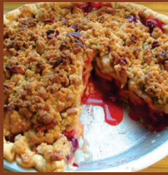
Cranberry Apple Pie $10.00