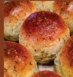
Cottage Cheese Dill Rolls $5.00 per dozen