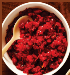
Cranberry Relish $3.00 pint

Additional menu and speciality items will be available to purchase at EVIT on pick-up days.