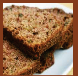
Banana Walnut Bread $8.00