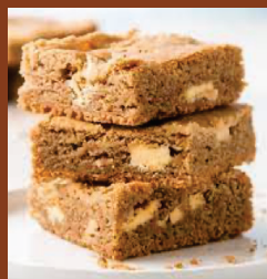
Gingerbread Blondie $8.00