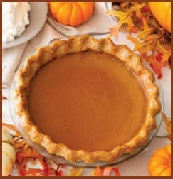
Pumpkin Pie $10.00