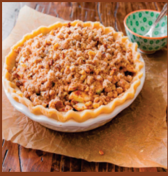
Apple Pie $10.00