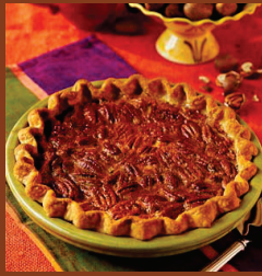
Pecan Pie $13.00