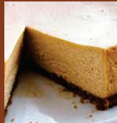
Pumpkin Cheesecake $13.00