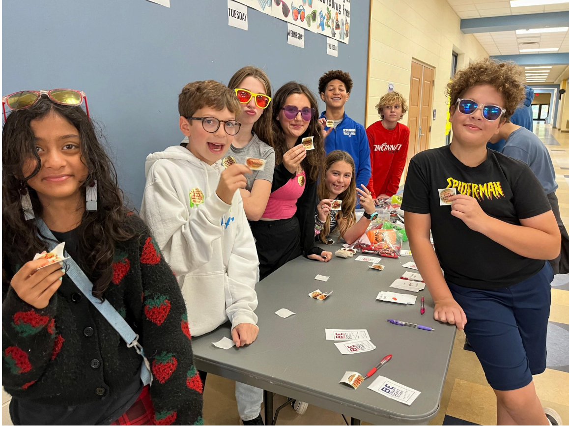
Red Ribbon Week pledges on display.