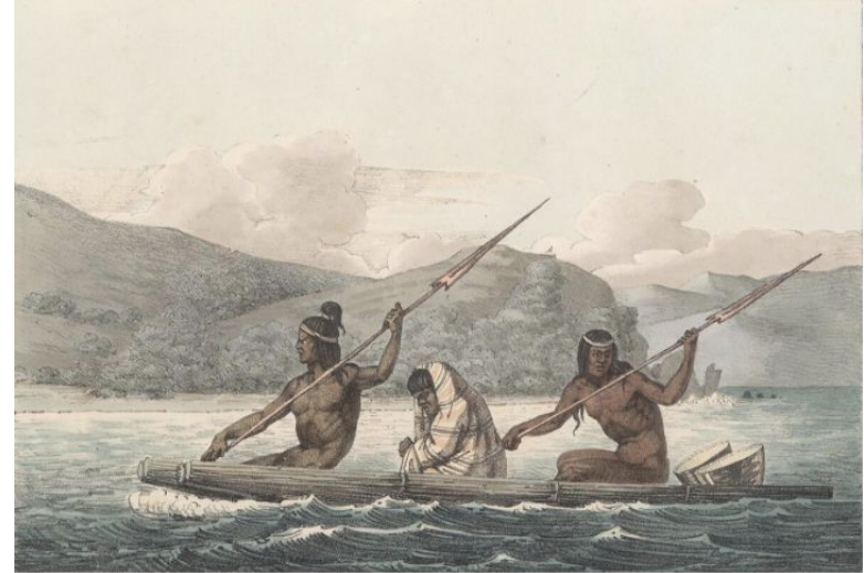
Painting of three Ohlone people crossing the waters in San Francisco Bay by Louis Choris.

This land on which our district was established was, and continues to be, of significance to the Muwekma ( Mew-weck-mah ) Ohlone tribe. Today we acknowledge the impact that colonization had on the Chechenyo/Muwekma Nation, and recognize our responsibility to help them heal from this history and secure a sustainable future.